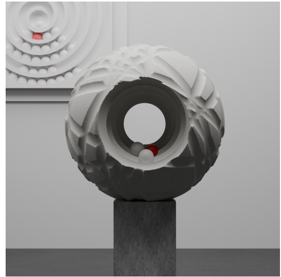
Sculpture Sphere of Life

His artistic vision is unmistakable: art making you think!